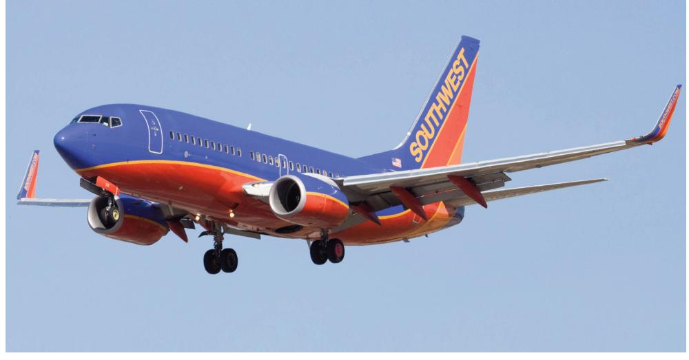
Building on the Foundation's Knox Supreme Court victory, a group of airline employees are seeking to ensure that union bosses receive consent from air and railway workers before collecting dues for political activities.