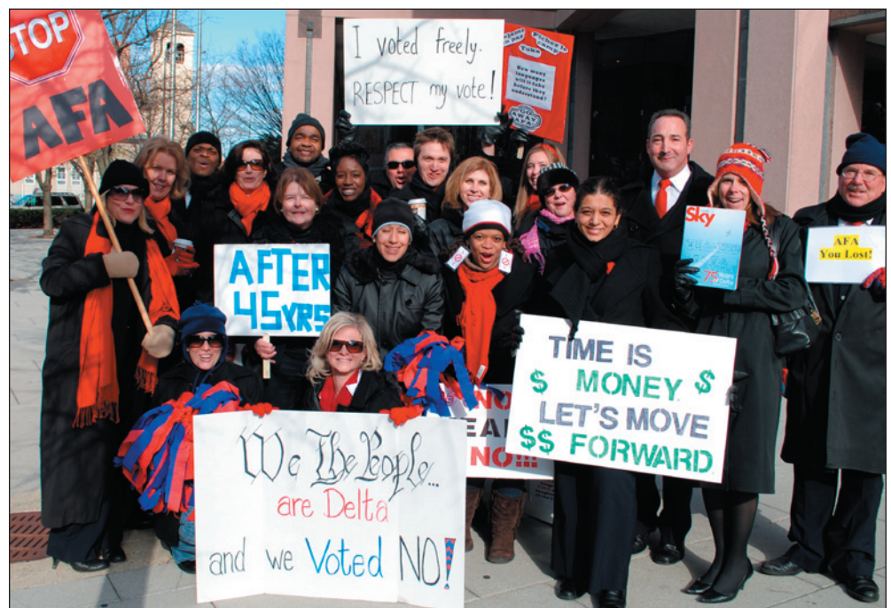
Over 30 Delta flight attendants picketed AFA union boss headquarters on their day off to show their displeasure with the union organizers' strong-arm tactics.

"The law is stacked up against the worker. We do not have the right 'not to join' a union."