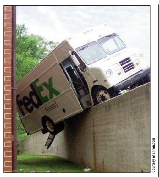
Under proposed organizing rule changes, union bosses could increasingly topple U.S. commerce by calling nationwide strikes.

The two former union officials President Barack Obama placed onto the three member NMB voted to preliminarily discard the agency's policy of requiring a true majority of all workers within a bargaining unit to decide if they wish to be represented by a union. Instead, they intend to implement a new procedure that requires only a majority of workers actually voting in a union organizing election to make that decision for the