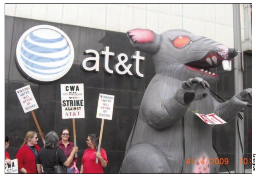
CWA union bosses across the country have used an inflatable rat and other far uglier tactics to browbeat AT&T into selling out its workers.

CWA union lawyers attempted to block the employee-initiated election because the request for the election was not made within the 45-day window period. However, the NLRB regional director in Seattle rejected the union lawyers' tactics because the employees